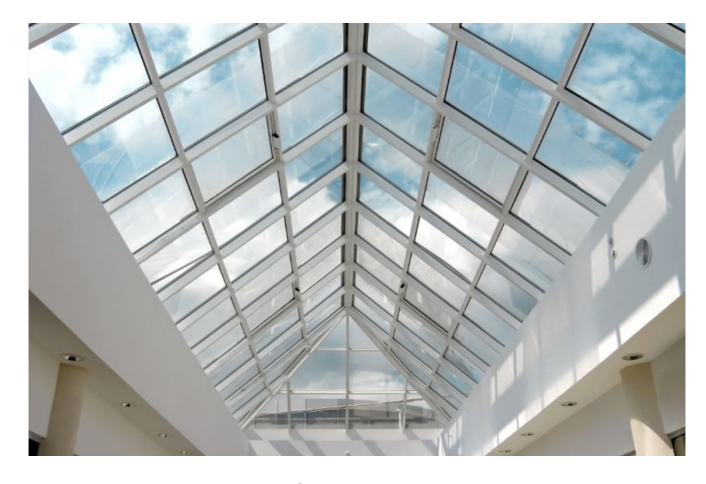
HygieniaTouch Self-cleaning TiO<sub>2</sub> glass coatings can be applied on tempered glass, coated glass, insulated glass and laminated glass.

Upgrade to TiO<sub>2</sub> coated glass today and embrace a sustainable, and visually stunning environment for years to come. Experience the difference with TiO<sub>2</sub> technology - revolutionising the way you perceive glass surfaces.