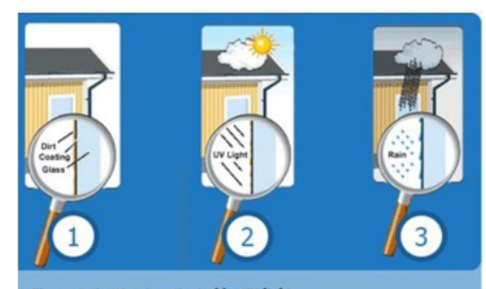
Figure 1: Coating is activated by UV light ter installation the special coating needs 5 to 7 days exposure to daylight to activate fully

Transform the visual appeal of your space with sleek and pristine glass surfaces. TiO<sub>2</sub> coatings maintain clarity and brightness, enhancing the aesthetic while promoting a clean and inviting ambiance.